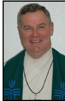
Pastor, St. Andrew Presbyterian Church Albuquerque, New Mexico, and Professor of Religious Studies, UNN